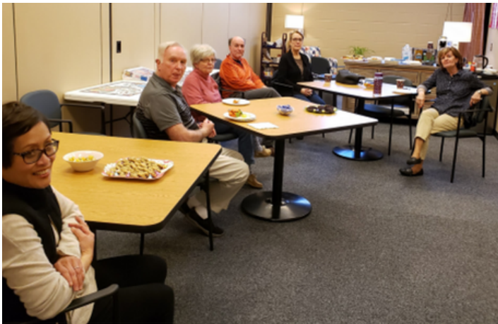
Voter Conversation 4/12/2022

Civic information includes topics like how to register and when and where to vote, profiles of candidates, who is part of Town government, how local decisions get made, and access to current meeting schedules and minutes. Basically civic information includes whatever local voters want and need in order to feel like they can participate fully and have an impact on local decisions.